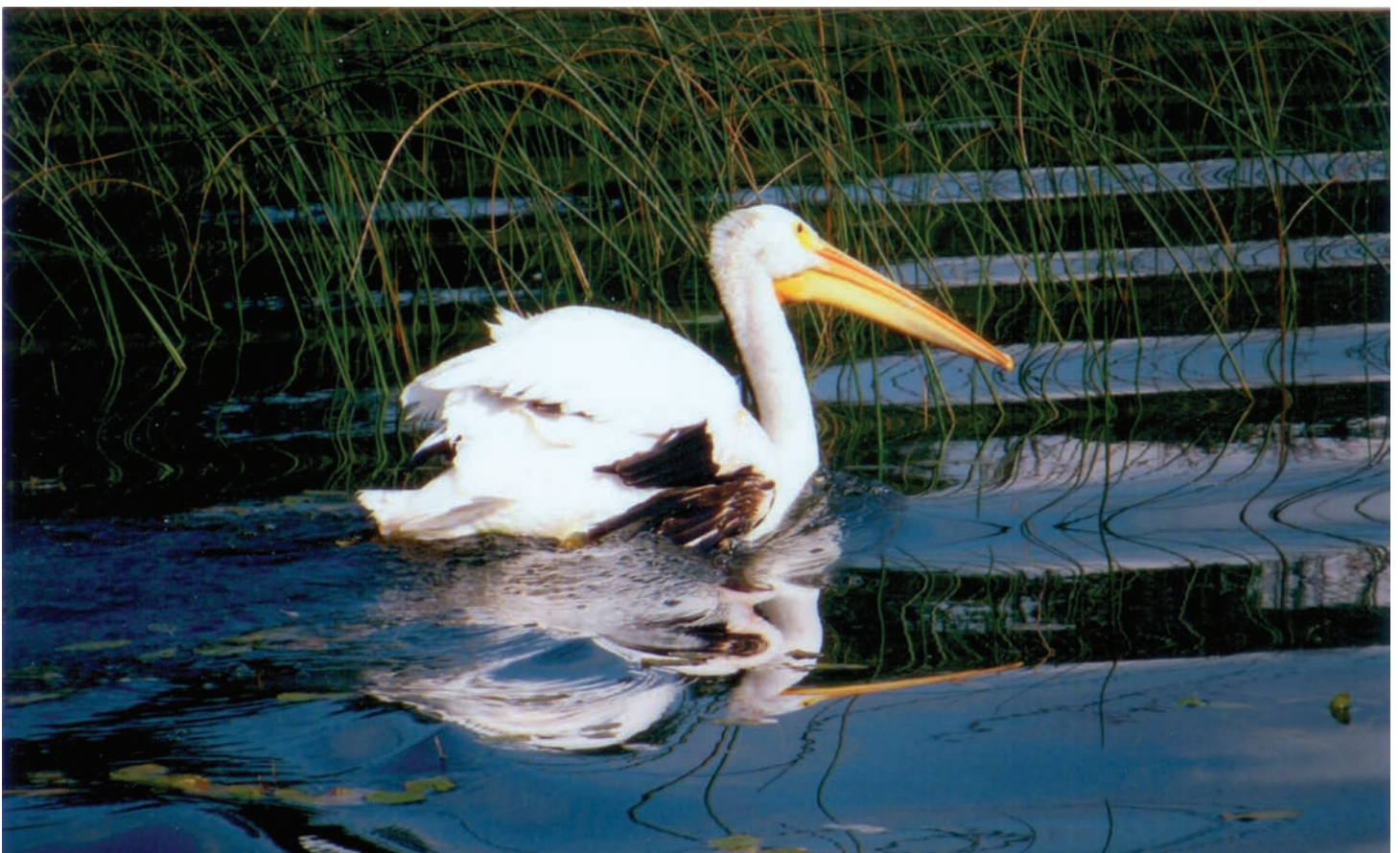
Tamarac Photo Contest 2011 People's Choice Winner – Pelican Reflections by Diane Turcotte.

PRSR STD US POSTAGE PAID DETROIT LAKES, MN 56501 PERMIT NO. 707