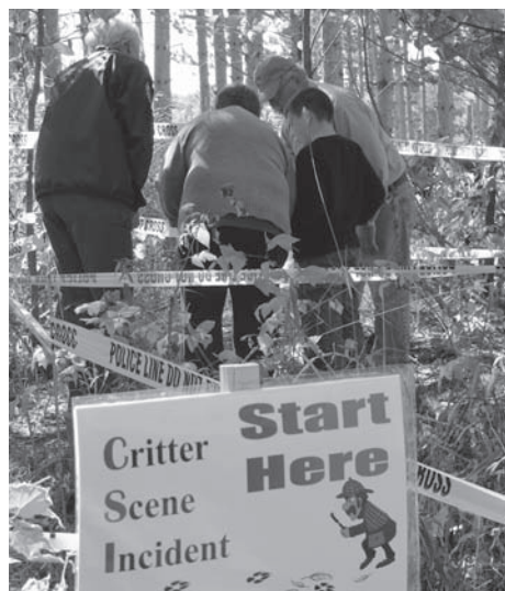
Visitors solved 'critter scene incidents' along the hiking trail.