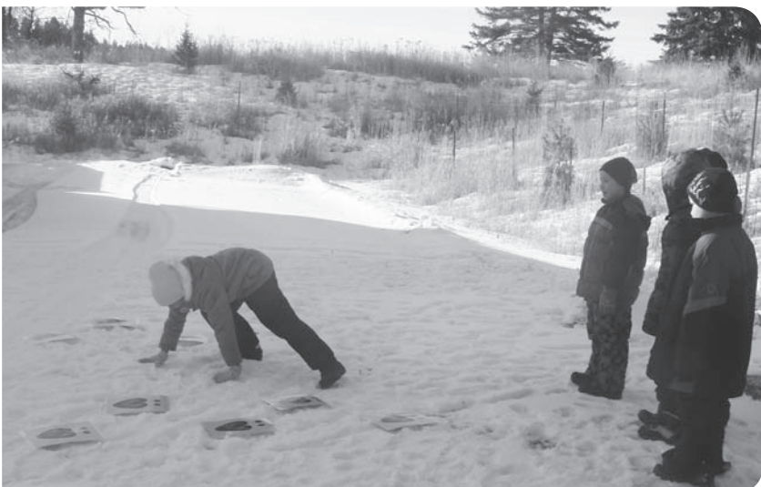
Circle of Life students demonstrate how animal move to make hopping or walking tracks.